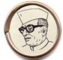
Kanhaiyalal Maniklal Munshi

Constituent Assembly at the stroke of midnight on August 15, 1947: