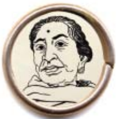
Sarojini Naidu (1879-1949) born: Andhra Pradesh. Poet, writer and political activist. Among the foremost women leaders in the Congress. Later: Governor of Uttar Pradesh.