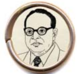
Bhimrao Ramji Ambedkar

(1887-1971) born:Gujarat. Advocate, historian and linguist. Congress leader and Gandhian. Later: Minister in the Union Cabinet. Founder of the Swatantra Party.