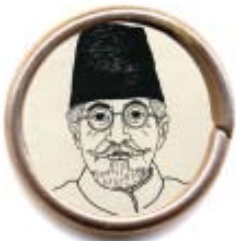
Abul Kalam Azad

The familiarity with political institutions of colonial rule also helped develop an agreement over the institutional design. The British rule had given voting rights only to a few. On that basis the British had introduced very weak legislatures. Elections were held in 1937 to Provincial Legislatures and Ministries all over British India. These were not fully democratic governments. But the experience gained by Indians in the working of the legislative institutions proved to be very useful for the country in setting up its own institutions and