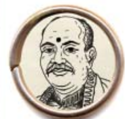
Shyama Prasad Mukherjee

(1891-1956) born: Madhya Pradesh. Chairman of the Drafting Committee. Social revolutionary thinker and agitator against caste divisions and caste based inequalities. Later: Law minister in the first cabinet of post-independence India. Founder of Republican Party of India.