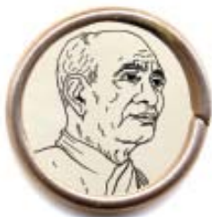
Vallabhbhai Jhaverbhai Patel

(1875-1950) born: Gujarat. Minister of Home, Information and Broadcasting in the Interim Government. Lawyer and leader of Bardoli peasant satyagraha. Played a decisive role in the integration of the Indian princely states. Later: Deputy Prime Minister.